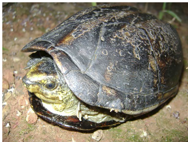
Figure 1. Specimen of Kinosternon scorpioides scorpioides from Imperatriz, Maranhão, Brazil.

Kinosternon scorpioides (Figure 1) is a turtle species found on the banks of rivers and flooded fields of certain regions of the state of Maranhão, Brazil, mainly in the Baixada Maranhense. They are an integral part of the wild fauna of the Maranhão (Viana et al. 2013). In the present record, K. scorpioides ,