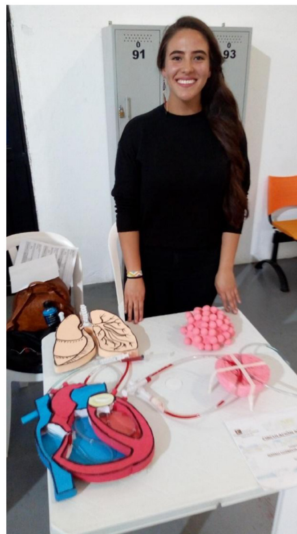
Figure 3. Students depicting cardio respiratory physiology along with alveolar and systemic gas exchange in fish and mammals. This image represents the exposure of primordial organs as lungs and heart to finally obtain the background of respiration.