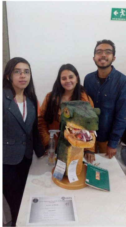
Figure 2. On the left image students represent the physiology of digestion in lactating ruminants in the digestive compartments with commonly used materials such as paper and probes. On the right image this biomodel explains the physiology of venom production in snakes by means of glands and sprays that simulate venom ejection.