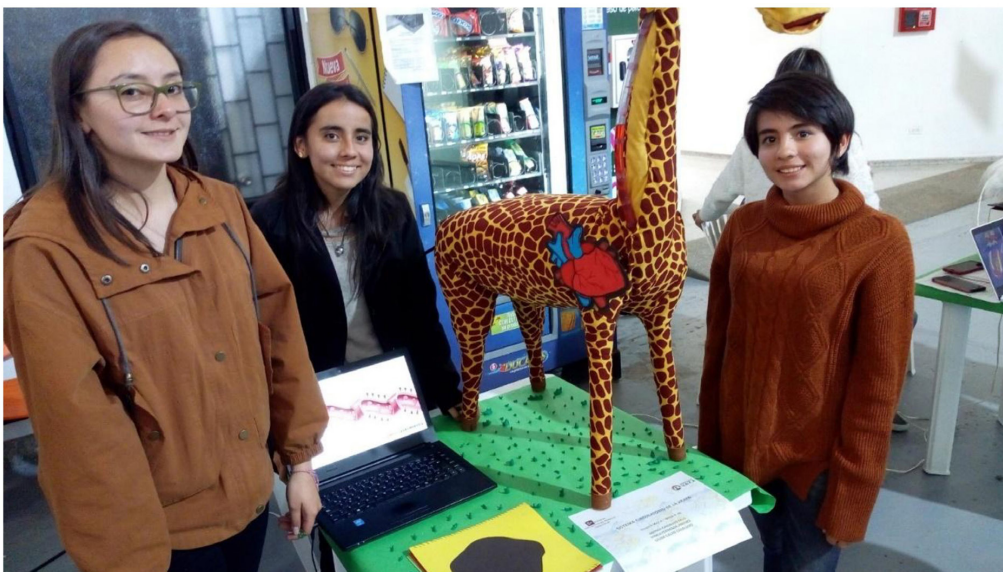
Figure 4. This is a biomodel on cardiac physiology in giraffes, the students made this model centered on the question: "how is it possible for the giraffe to carry blood to the head on such a long neck?".

Following Bardin's methodology, the analysis process was conducted in three structured steps. In the first step (pre-analysis) , the students' written reflections were organized to clearly distinguish the two positions—whether or not students would consider the use of live animals—as a basis for further analysis. In the second step (exploration of the material) , each text was summarized to extract the student's final stance on the issue, identifying the rationale or justification behind their position. For example, one student wrote: "I do not agree with exploring the function of erythropoiesis at the cost of an animal's life, since there are now alternatives such as simulators, molecular methods, and didactic materials that represent this already established knowledge." This statement clearly reflects opposition to the use of live animals, grounded in the availability of alternative methods. In the third step (treatment of the results: inference and interpretation) , thematic categories were constructed based on the students' viewpoints. These categories enabled the grouping of all narratives according to shared perspectives. The resulting categories included: