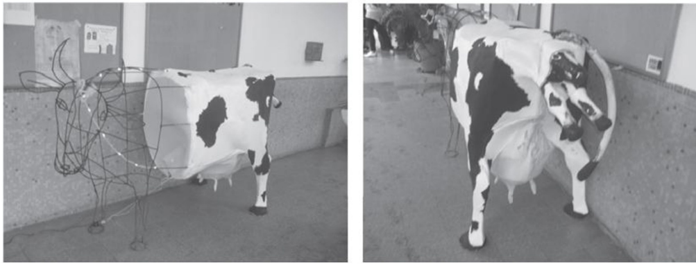
Figure 1. An example of a didactic biomodel built by veterinary medicine students at the University of Antioquia (Colombia) to exemplify bovine parturition. Taken from Lenis and Arango (2011).